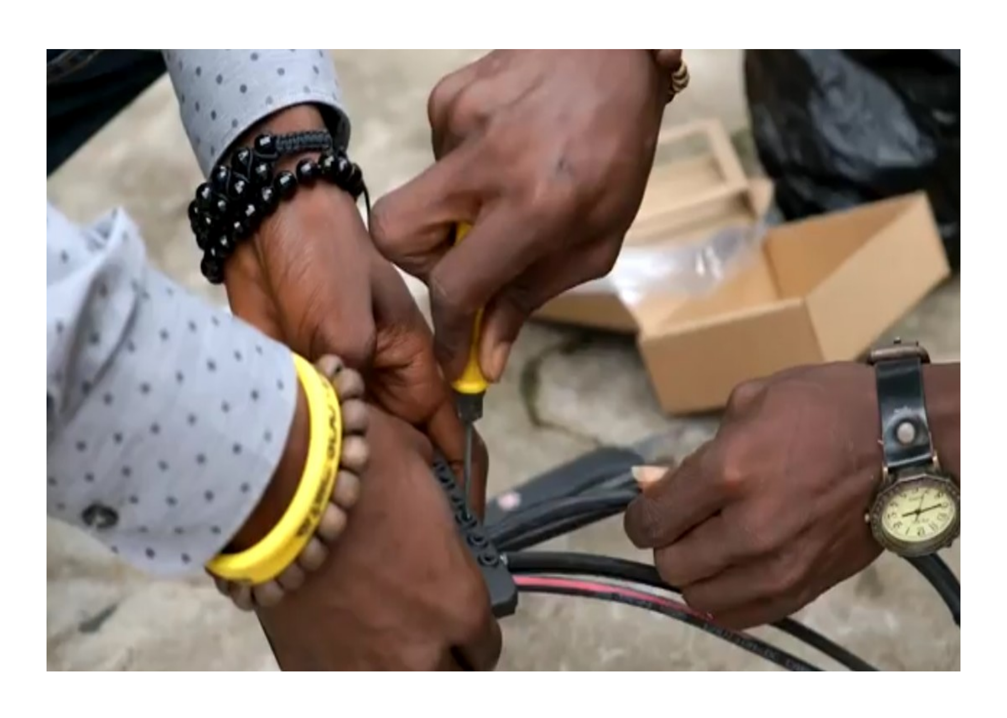
Culture Radio, Sierre Leone, 2015, "Ebola Bye Bye", MiCT