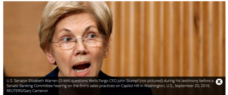
U.S. Senator Elizabeth Warren (D-MA) questions Wells Fargo CEO John Stumpf (not pictured) during his testimony before a Senate Banking Committee hearing on the firm's sales practices on Capitol Hill in Washington, U.S., September 20, 2016.